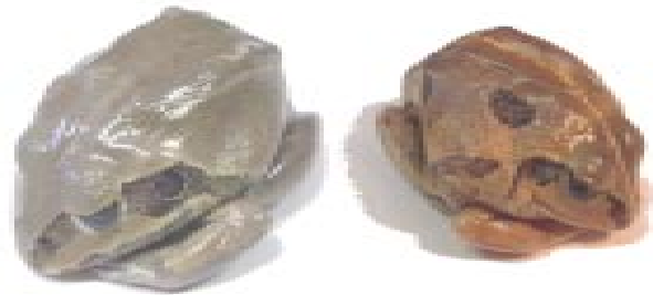
Figure 1. Aestivating C. australis (left) and C. cultripes (right), showing semi-transparent cocoon enveloping the entire body, except for the nares.

small hole in the lid for ventilation. The chambers were placed in a dark cupboard and the frogs left undisturbed except for inspection every 2 to 4 days. Ambient temperature was 24 \pm 1 °C.